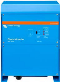
Phoenix Inverter 24/5000