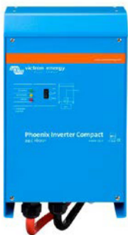
Phoenix Inverter Compact 24/1600

The possibilities of paralleled high power inverters are truly amazing. For ideas, examples and battery capacity calculations please refer to our book 'Energy Unlimited' (available free of charge from Victron Energy and downloadable from www.victronenergy.com ).