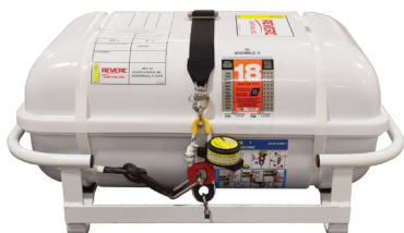
Low Profile Container