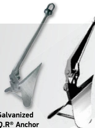
Galvanized C.Q.R.® Anchor

The C.Q.R.® anchor has gained legendary status for its superior performance. The original drop-forged construction of the C.Q.R.® anchor increases its strength and reliability under load – a genuine C.Q.R.® anchor will not break. Its hinged shank delivers consistent setting and holding even in the very worst conditions. The C.Q.R.® anchor is guaranteed for life against breakage 1 and has Lloyd's Register General Approval of an Anchor Design 2 as a High Holding Power anchor.