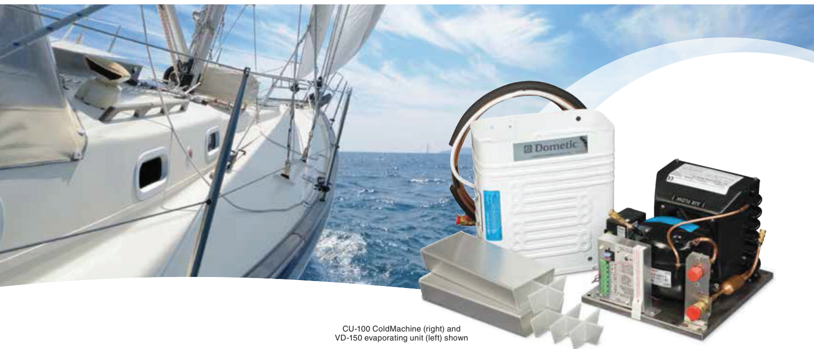
CU-100 ColdMachine (right) and VD-150 evaporating unit (left) shown

Performance, efficiency, and quality are hallmarks of Adler/Barbour ColdMachine Kits by Dometic. Two configurations are offered: The air-cooled CU-100 ColdMachine, and the air- and water-cooled CU-200 SuperColdMachine. Powered by a Secop BD50F compressor, these easy-to-install units provide up to 15 cu. ft. (424 liters) of refrigeration and work with a variety of 100-Series evaporators (see reverse side).