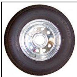
RADIAL TIRES (on some models)