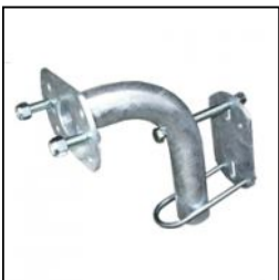
SPARE TIRE AND CARRIER