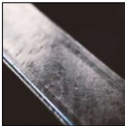
Galvanized Steel Frame