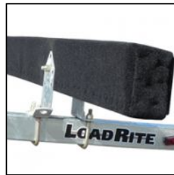
Carpeted Pressure- Treated Wood Bunks