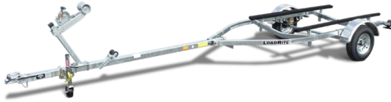
Image for representation only. Options and features may differ.