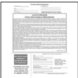
2 Plus 3 Years Coupler to Taillight Warranty