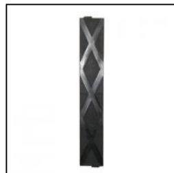
QUICK-SLIDE® BUNK COVERS