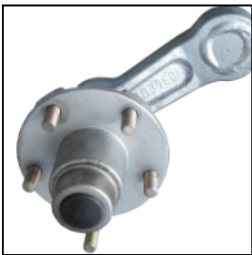
NEW TORSIONS ON 14F,16F